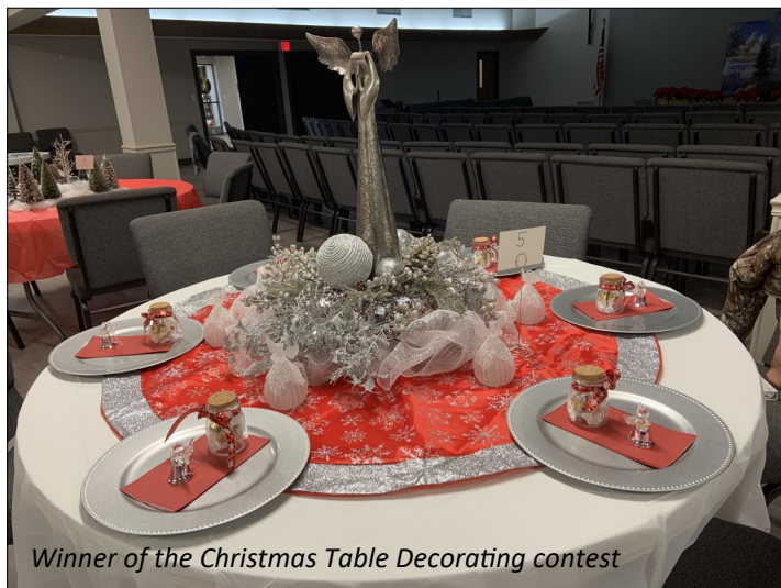
Winner of the Christmas Table Decorating contest