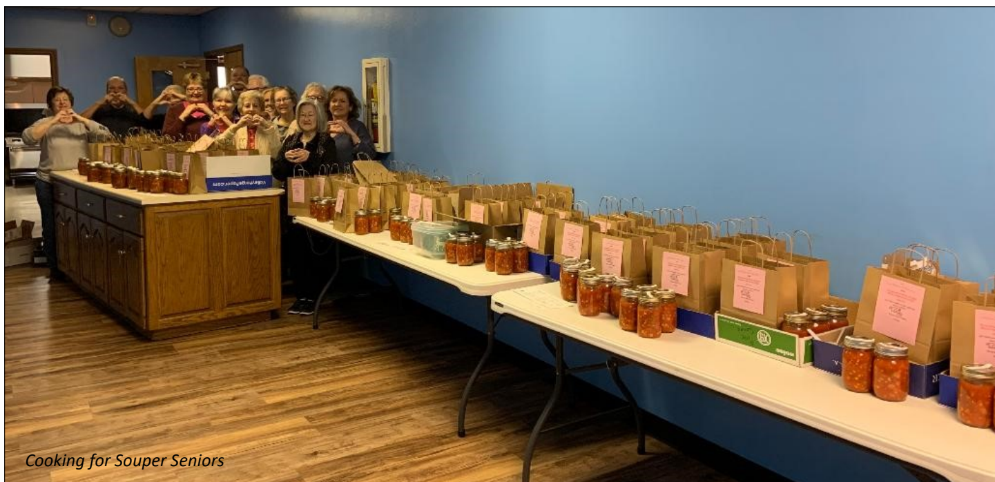
Cooking for Souper Seniors

Keep watching the bulletin and announcements for more ways to be involved with our WINGS ministry!