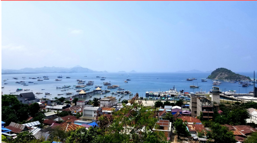
Labuan Bajo Anchorage

This beautiful anchorage which is a part of the Sunda Islands, is near Komodo Island, of the Komodo Island Dragon fame. It was a layover spot on our long journey to Western Nusa Tenggara in January. Here we were able to resupply, rest and share with many people we met in the town. This is a place where we may return in time to come.