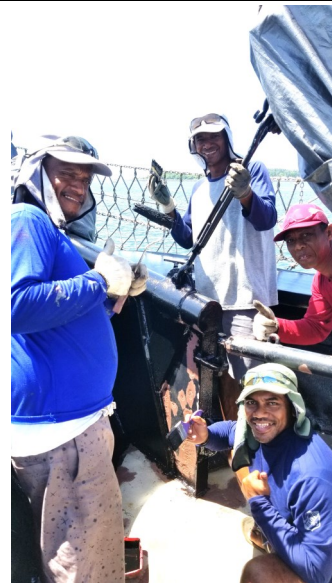
The crewmen painting the forecastle bulwarks and bowsprit after all the welding was finished.