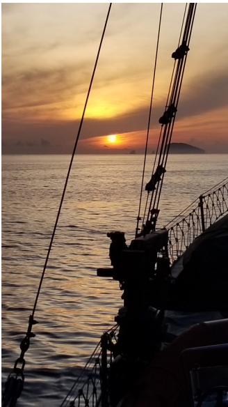
Manggis Bay at sunrise. The sail was 25 nautical miles for this day.

"No longer is it an easy task to be different from the world."