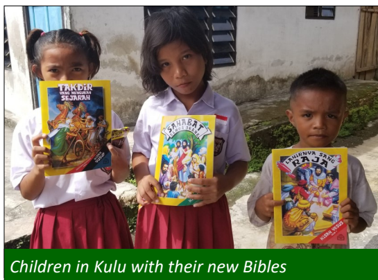
Children in Kulu with their new Bibles

While anchored in Bitung Harbor, high winds caused them to reset the anchor several times, an exhausting and nerve-wracking experience. Finally, on a calm day, they were able to sail to the nearby village of Kulu, where they