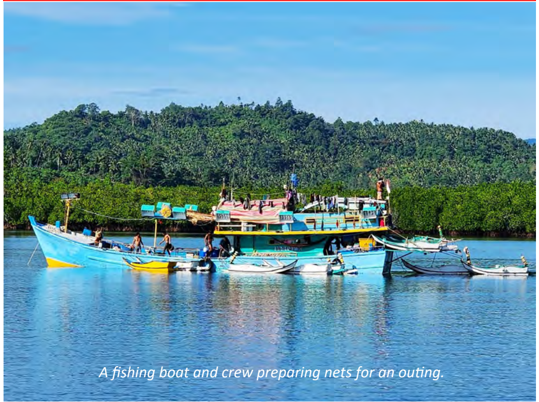
A fishing boat and crew preparing nets for an outing.