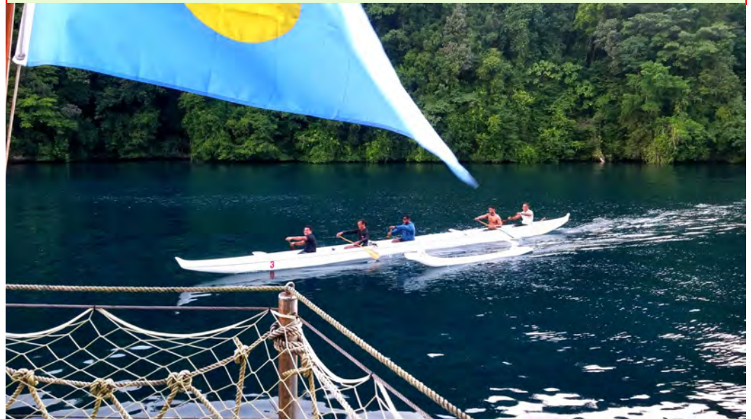
"Oarsmen Of A Traditional Micronesian Canoe"

Training for the Micronesian Games, these oarsmen of Palau manage their long traditional canoe with ease and efficiency and with only the cadence call of the steersman at the stern, they move silently through the water. One cannot help but imagine times long ago when oceans were crossed in such craft.