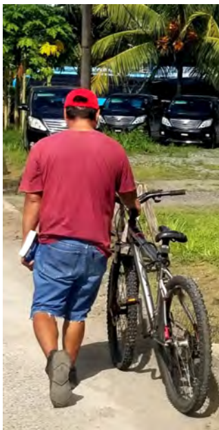
A man, his bike and a new Bible. He was a lonely soul. I pray his joy returns.

"This is going to take an increase in offerings to the work."