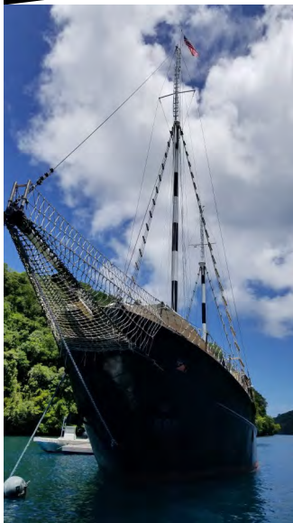
Underneath NATIVA'S bow. Clean hull. Two months until sailing for Indonesia.