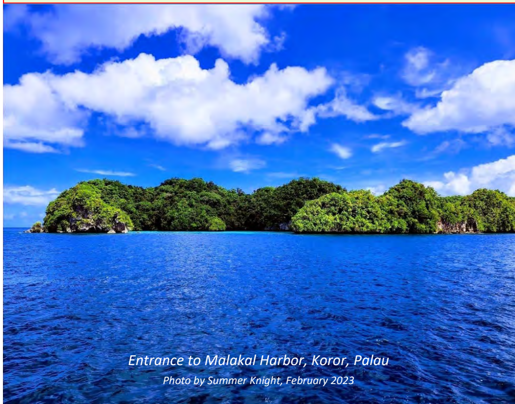
Entrance to Malakal Harbor, Koror, Palau