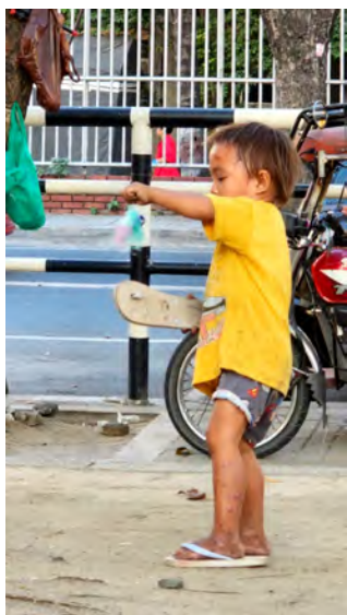
A small child plays with a flipflop and a rock wrapped in plastic on a street in Manila.