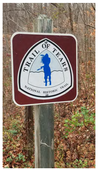
Signs marking The Trail of Tears can be seen in many parts of the southeastern states. It's history that needs remembering.