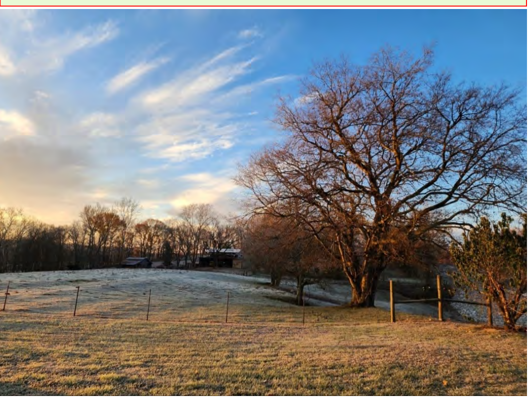
"Thanksgiving on the Family Farm"