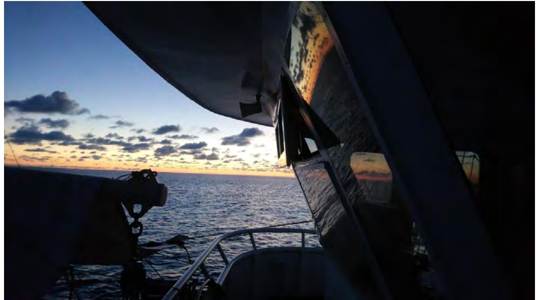
"Sunset Crossing, Open Sea"

This scene was captured by Summer on our crossing from the home port to Hatohebei Islands in southwestern Palau. The serenity of the moment can be clearly seen by the reflection in the windows of NATIVA's bridge.