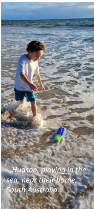
Hudson, playing in the sea, near their home, South Australia.