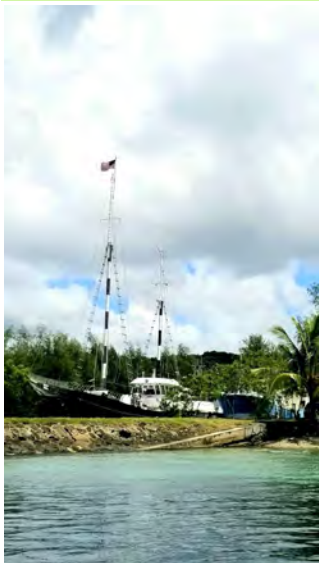
RIM NATIVA secured in the commercial marina at Babeldaob Island, Palau. She is in cold layup for two months while we're away.

"One of our main concerns for voyaging in the coming year will be the availability and cost of diesel fuel."