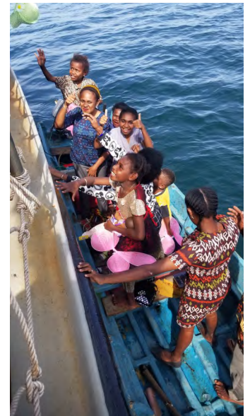
A Papuan family, one of many who came to the ship to receive what we shared.