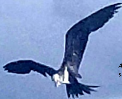
A Great Frigate Bird spreads its wings over the ship as it hovers, awaiting a meal of flying fish. —May 2022

Glen & Summer Knight Remote Island Ministries