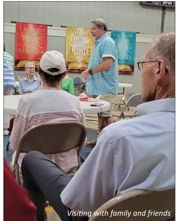
Visiting with family and friends

Worldwide Literature and Missionary Supply plans to ship a container of supplies to Palau for RIM in the near future. Palau is one of the most expensive destinations for shipments; it will cost about $17,000. Anyone who would like to help fund the shipment can make an offering designated “shipment” to RIM.