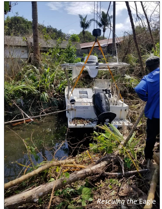
Rescuing the Eagle