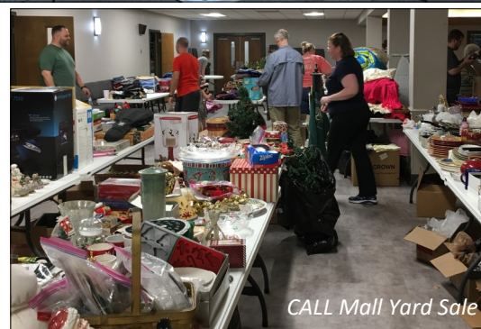
CALL Mall Yard Sale