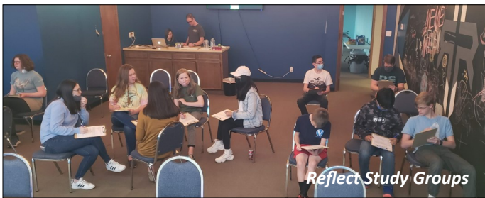
Reflect Study Groups