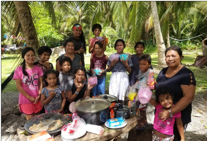
Residents of Pulo Anna Island