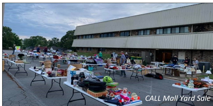
CALL Mall Yard Sale