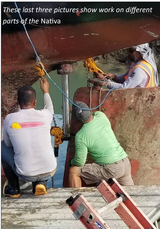
These last three pictures show work on different parts of the Nativa