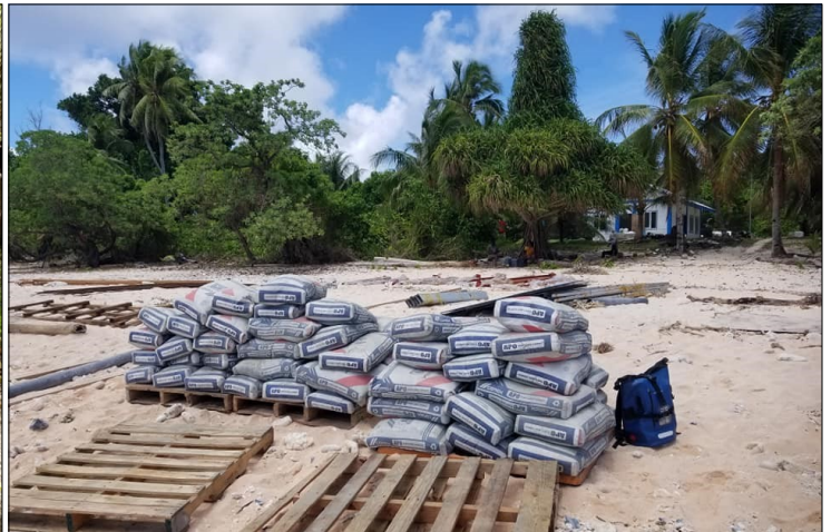
Building supplies for typhoon shelter and dispensary

The plan was to make a second trip to Pulo Anna Island about a week after their return from the first. However, it was not to be. As they watched the development of a tropical storm, they moved the departure date back. The storm, Surigae, reached typhoon status and raged over them and past, and Bro. Glen realized they would not make the second voyage, and even faced the possibility they wouldn't make their departure for the states as planned. It was very rough as the crew weathered the storm for hours aboard the Nativa ; the mooring failed and she took quite a beating. Everyone aboard was safe, praise God!