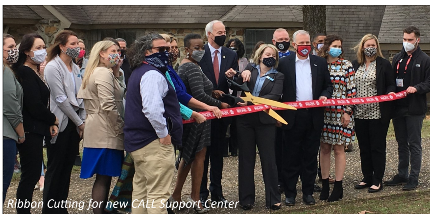
Ribbon Cutting for new CALL Support Center