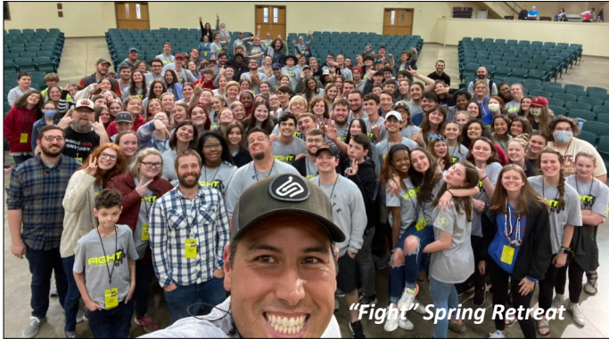
"Fight" Spring Retreat

Spring is here, and the Reflect Student Ministry has enjoyed every minute of it! In our midweek services we have just finished an in-depth study over Creation that did a great job of equipping our students with the tools they need to stand against the many popular false ideas about the origins of the world. We had a blast at the Spring Retreat "Fight" that was hosted at Budd Creek Baptist Camp. Our students were challenged to fight for the lost souls around them, fight against hell, and fight for the Gospel. Spring Break brought the opportunity to take a trip to the lake where we were able to hike, eat, swim (not me!), and fellowship! Our quick games on Wednesdays always bring laughter, competition, and growth in the relationships between the students and the leaders as well. A big thank you to the students who came