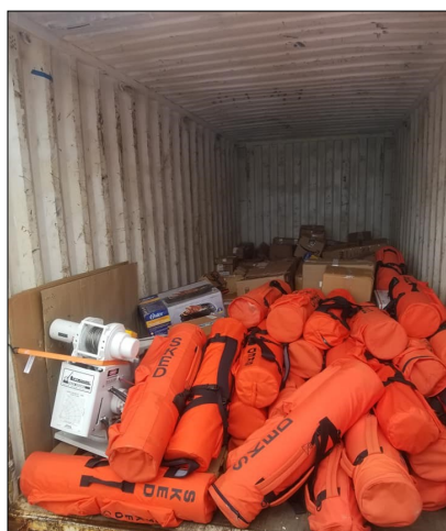
The unloaded container

In the middle of February, about the same time the snow storms were moving out of Arkansas, a different storm was moving towards Palau. The Nativa and crew had