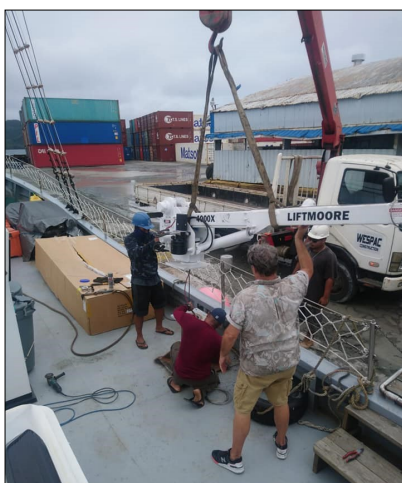
Mounting the new crane