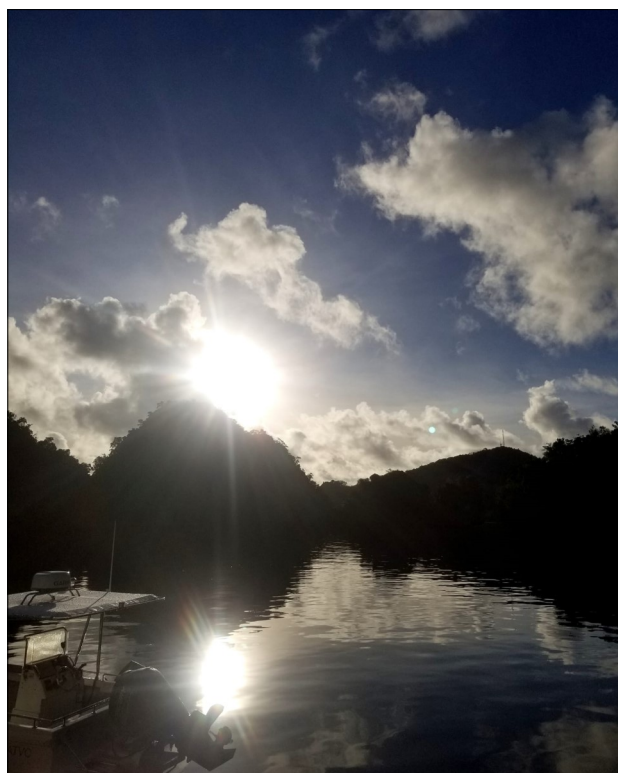
First sunrise of 2021 as seen from the Nativia in Palau