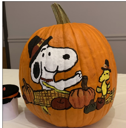
Noah Keen's pumpkin