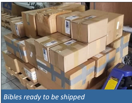
Bibles ready to be shipped