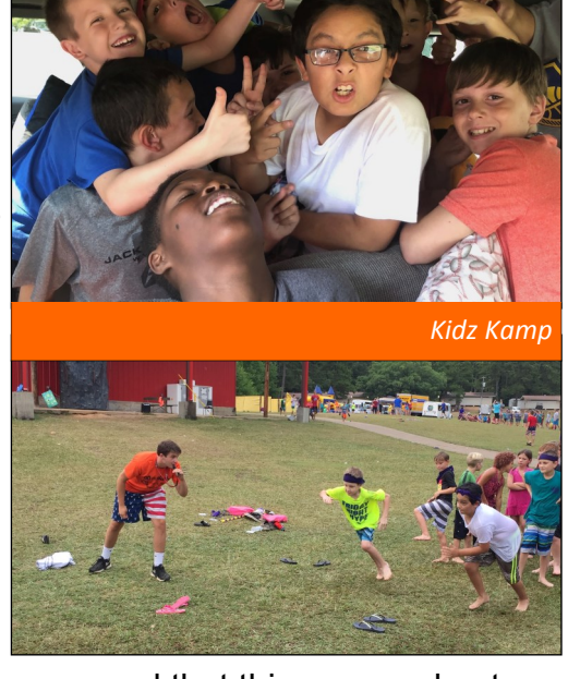
our congregation. Everyone agreed that this was our best summer at The Bogg by far!

possibly imagine. On the final day, one of our girls submitted to God's calling and prayed to make Jesus her Lord and savior! I cannot speak more highly of our leaders and the kids of