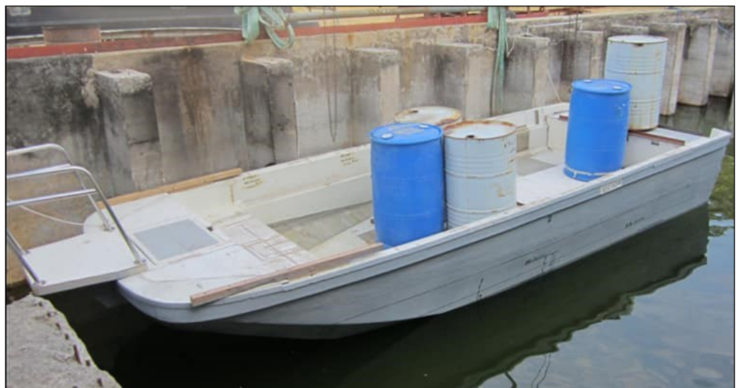
The EAGLE ATVC, still under construction

Another issue RIM has run into is the problem of transporting heavy equipment, cargo, and personnel from the Nativia to the islands they visit. The islands in that area of the Pacific are surrounded by shallow reefs that make it impossible for the Nativia to get close to the islands. The small craft they currently have to go from