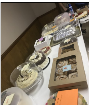
So many desserts!

One of the events our members look forward to each year is our annual Dessert Auction. This year it was held at the end of April, and it did not disappoint! The church stepped up and brought lots of beautiful desserts,