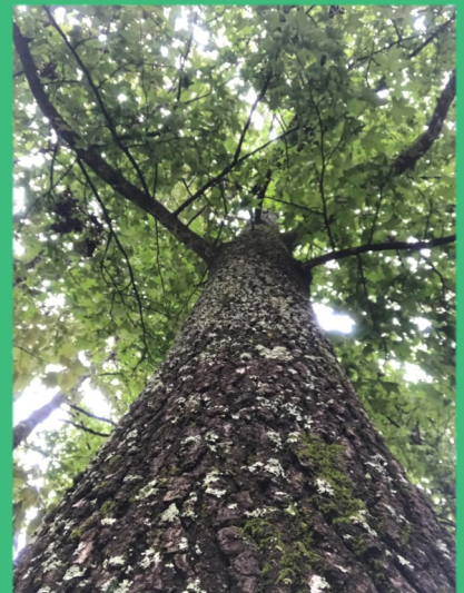
Ultimately, a chainsaw . . .