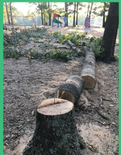
. . . had the Victory!