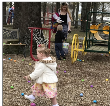
Searching for eggs

the potluck here at church. As usual, WINGS did a great job setting up and coordinating the meal. It was a wonderful day remembering what our Lord and Savior did for us!