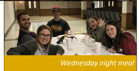
Wednesday night meal