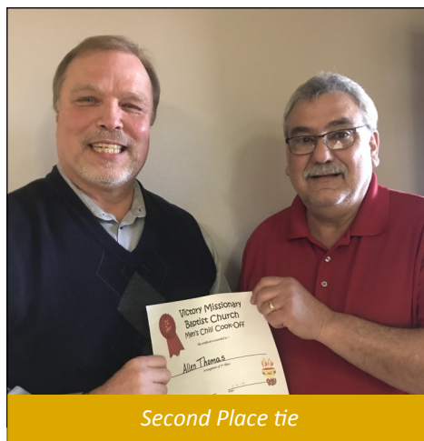
Second Place tie