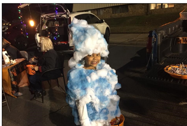
One of our guests enjoying the fun