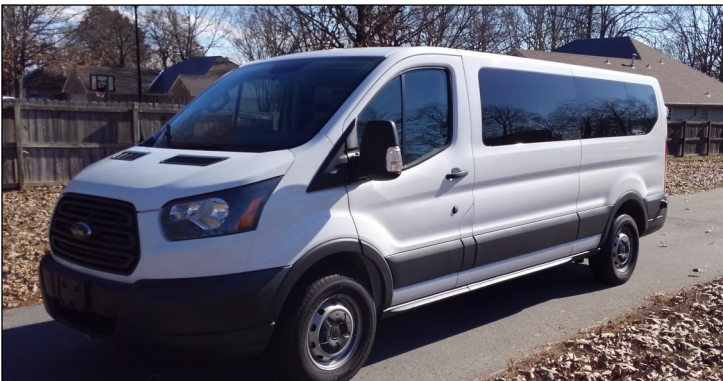
Our new 15-passenger van!