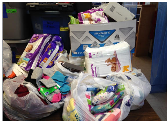
Donations from Girls on the Run at LISA Academy

During the Thanksgiving season, a team called Girls on the Run from LISA Academy did a community impact project. This year they decided to help foster families in our community. They had a clothing drive specifically collecting new socks, underwear, diapers and baby wipes. It was a very generous gift to our CALL Mall! Thank you so much for your generosity! The children of the Oasis Church also donated many new toys they collected for foster children. The CALL Mall also received a $200 donation from an anonymous member of Victory's church family. These