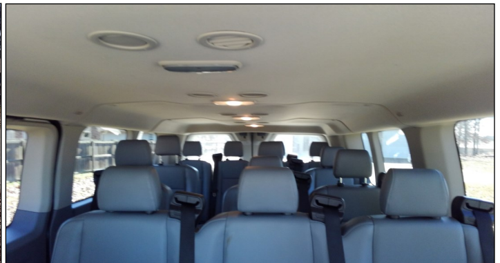
Inside the van