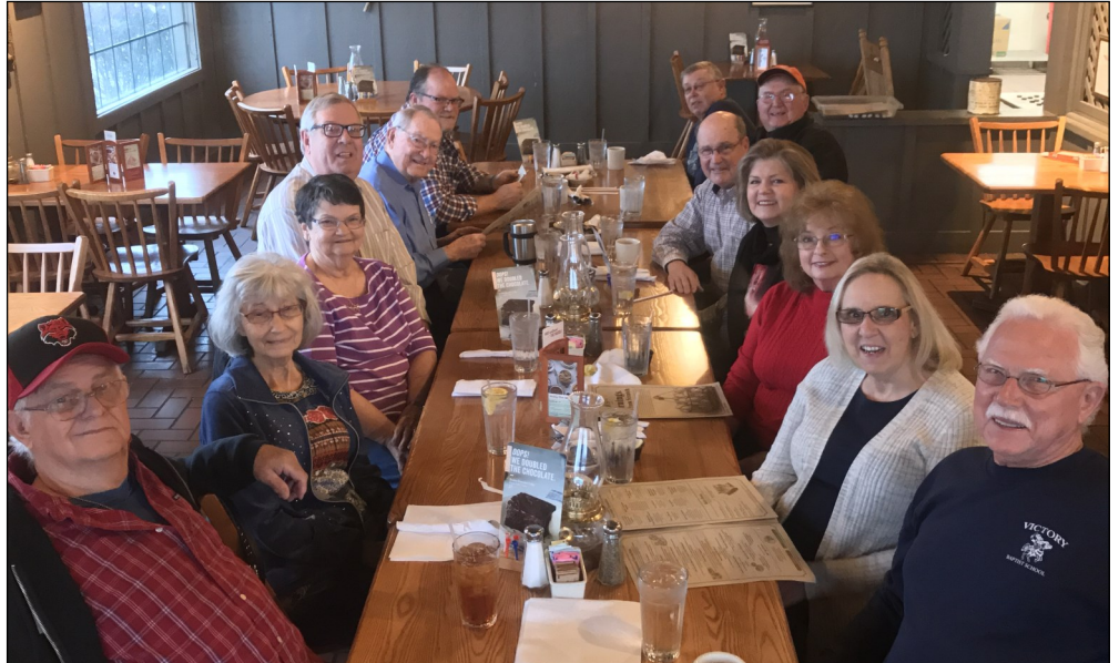
JOY Breakfast at Cracker Barrel

JOY meets for breakfast at Cracker Barrel in North Little Rock on the second Tuesday of each month at 8 am, and they meet for a potluck lunch at the church on the fourth Tuesday at noon.