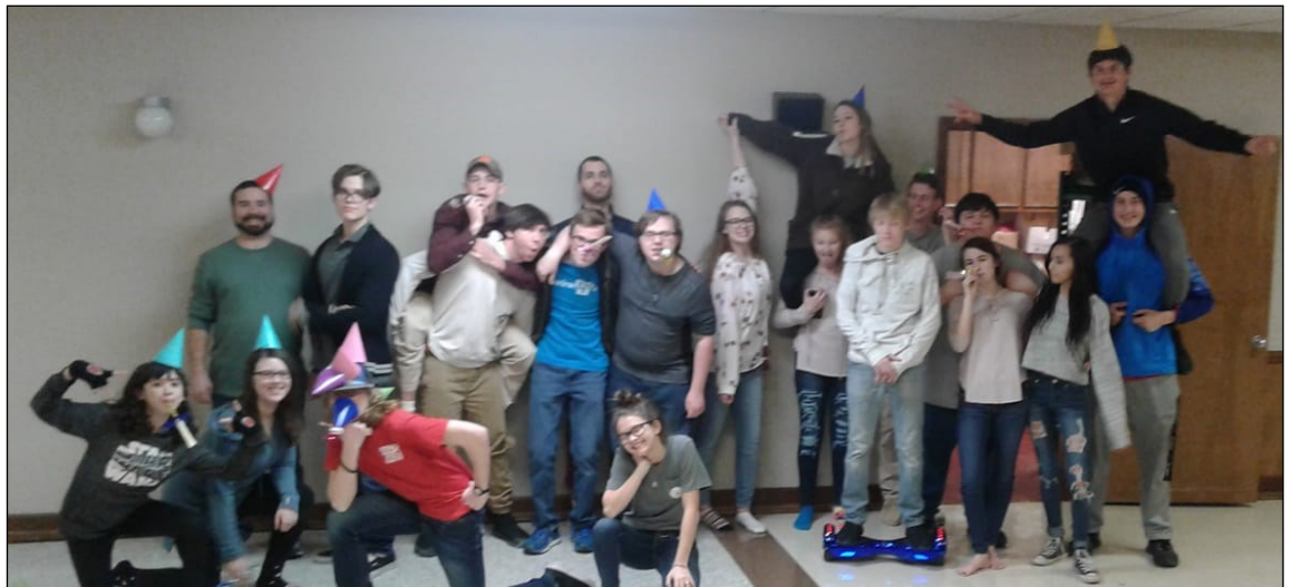
Ringin' in the new year!