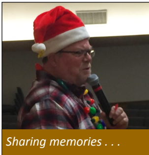
Sharing memories . . .