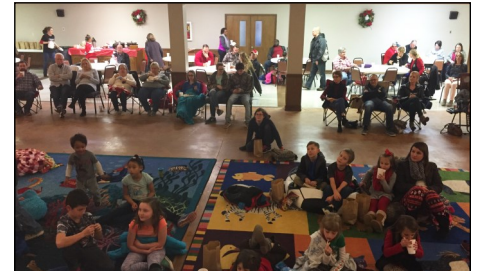
Getting ready for the show to start!