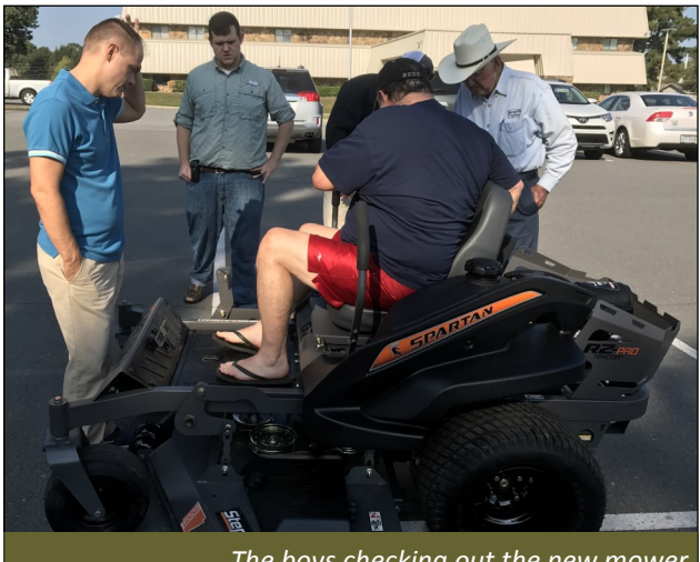
The boys checking out the new mower