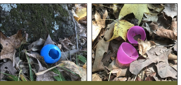
... found Easter eggs the kids didn't!