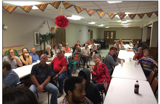
Waiting for dessert

Here at Victory, we like to get together and hang out, especially when there's food involved. Combine that with supporting our kids ministries, and you've got the makings of a great Dessert Auction! This annual fundraiser brings out the best in our members as they bid on desserts that members provide. Many of you showed up hoping to taste the sweets (even if you didn't win the bid) and watch the fun! As usual, there was much friendly competition over bidding on the delicious desserts, and about $3,800 was raised!! Thank you to our members for your generosity! 100% of the money will be used in our teen and children's ministries.