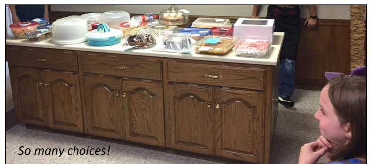
So many choices!