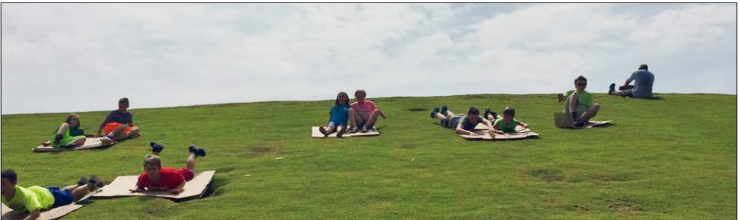
Cardboard sledding near Clinton Library