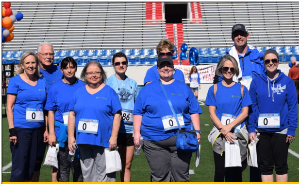
Walkers for Victory!

The CALL Mall has been busy over the past several months. We have had several foster parents come each week. Almost each week, there seems to be a new foster family that has found out about the mall and has been able to get things they needed. Some have come from Carlisle and Jacksonville. We are happy to see that the word is getting out about our Mall and that the Mall can be of help to those who are taking care of and loving on these foster children who so desperately need love! Donations still come in at different times. The Mall has