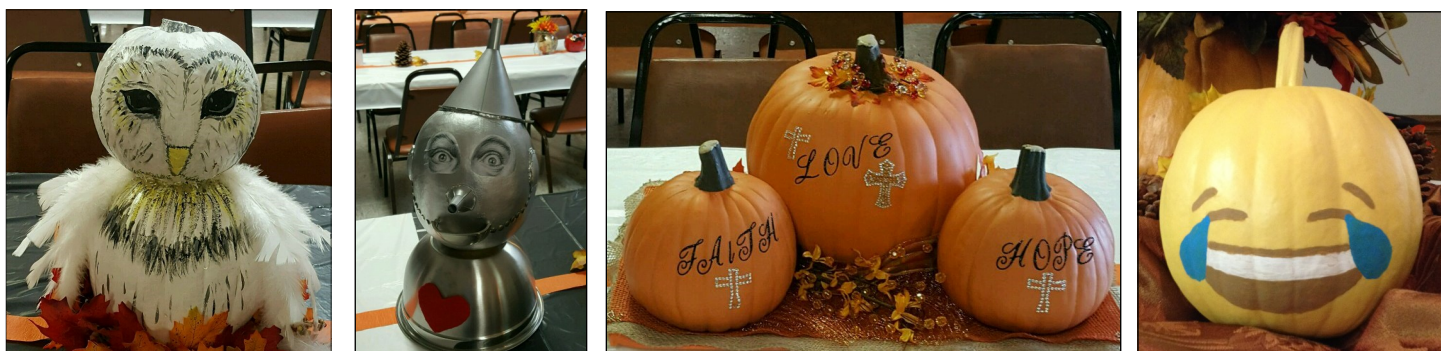
Adults (L-R): 1st place; 2nd place; 3rd place; People's Choice