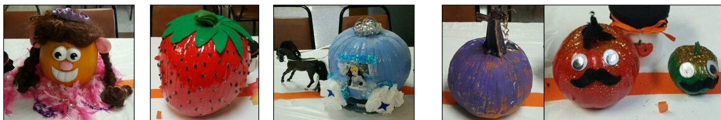
Youth (L-R): 1st place; 2nd place; 3rd place; People's Choice (tie)