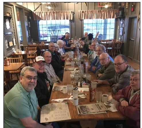
JOY Breakfast at Cracker Barrel

On the fourth Tuesday, join us for potluck lunch at noon at Victory. Bring your favorite dish and a friend or neighbor. If you work nearby, just drop in—there will be plenty of food for you. Check it out!