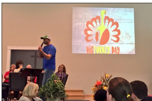
Thanksgiving Day Trivia

This year we named the event “VicTurkey Day” as a pun for fun. Not only did the name change, but the activities did also. It began with a tremendous catered dinner from Pig N Chik. Also, many desserts