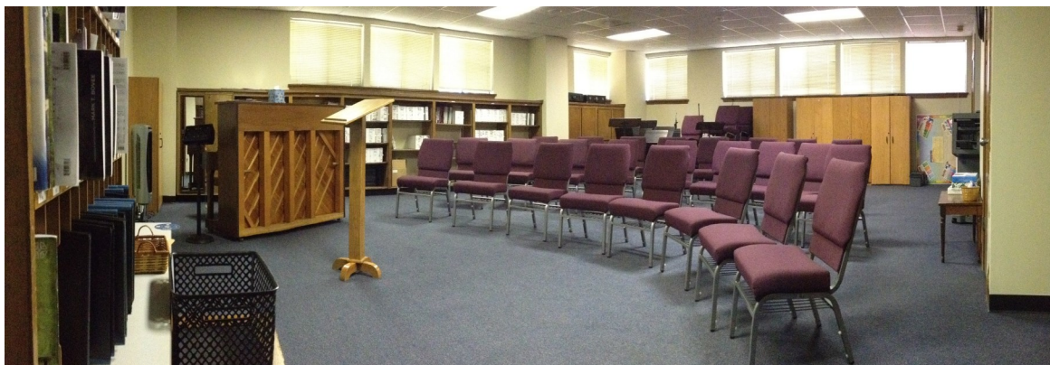
Our new choir room