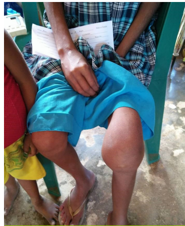
Results of starvation