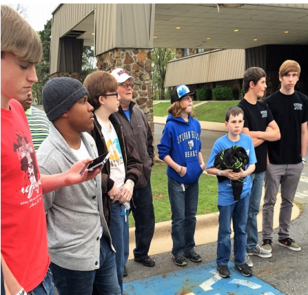
Getting ready for AYC