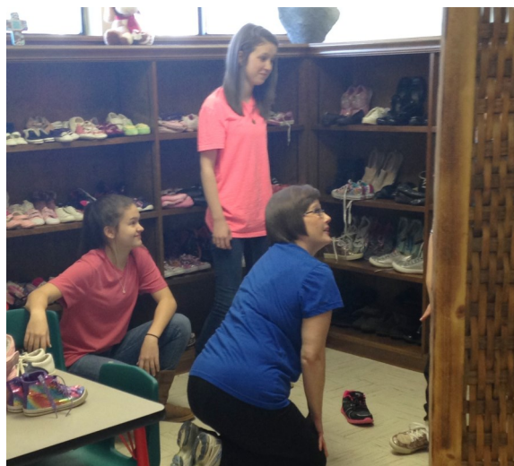
CALL volunteers with a young client

The CALL Mall has come a long way from January when we moved to our new home at 10000 Brockington Road. We have more space, new clothing racks, and new volunteers!! God has