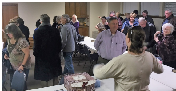
Getting ready for Bible Study

The church is an assembly of born-again, baptized people who gather together in one location to carry out the Great Commission given by the Lord Jesus Christ. A facet of the Great Commission is to teach His followers everything Jesus commanded. In order to do this, the church holds Bible studies as part of its regular operation. Wednesday night is one of these exact times for learning and growing in the Truth. At 6:30 pm in Room 105 at Victory, the adults of the church are welcome to gather for a time of challenging discussion. A wide range of issues and topics are brought up for the edification and knowledge of the followers of Christ at Victory.