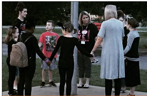
See You At the Pole

Elementary, bringing the encouraging words of Jesus (and not to mention, lots of donuts). In the end, over 100 kids were gathered together in prayer. And it wasn't just one school! I received messages all morning from different parents, informing me that their children were leading prayer with their friends at their own schools! This was a great way for our kids to open up to their friends—to not be afraid to shine for Jesus, and to shine on for more than just one day a year!