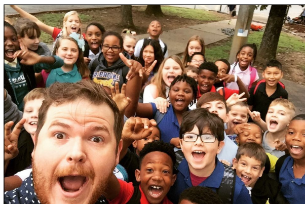
See You At the Pole

See You At the Pole: Our schools are in desperate need of Jesus. We live in a country with broken families and children living in total disconnect with each other and the world around them. That’s why See You At The Pole is so important. It’s a national day of prayer where kids around the country gather around their flagpole and pray for their peers, teachers, and campus. It’s proven to be quite popular with High School and Jr. High students, and with elementary kids it is slowly gaining momentum. This year I had the pleasure of joining the kids of Oakbrooke