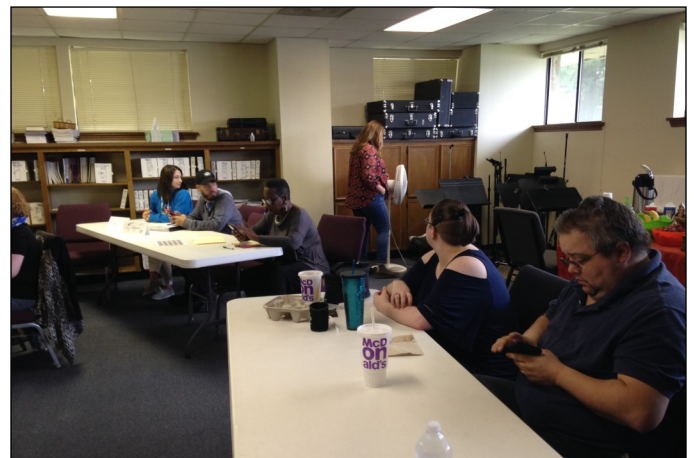
The CALL training