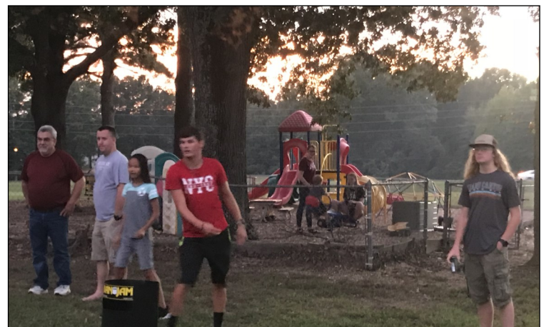
Teens participating in Fifth Sunday fun!