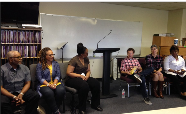
The CALL training