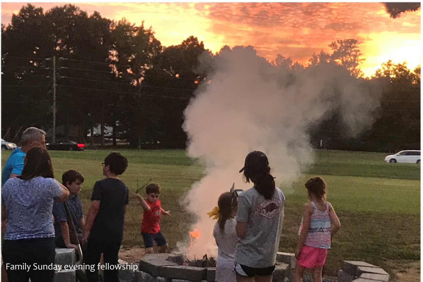
Family Sunday evening fellowship

If you do not wish to receive this newsletter or are receiving it in error, please call or text 501-658-0813 and leave your name/address.