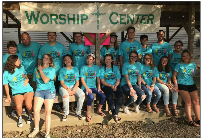
Teen Camp at Bogg Springs

One of the traditions of Victory Baptist Church is the teens' trip to Bogg Springs church camp every summer. Our children look forward to this trip all year long—and some of our adults, too! Last summer was no exception for our teen group. While they missed riding together on the big blue bus, they still had a memorable time. In fact, they said it was the best year ever! The fact that they say that every year shows what a great camp it is! The theme this summer was “I pity the fool!” based on Proverbs 1:7, “The fear of the Lord is the beginning of knowledge, but fools despise wisdom and instruction.” As always, they received sound biblical instruction from