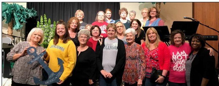
ABA Women's Retreat